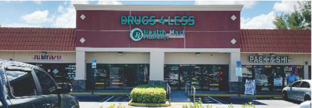
Existing Conditions: Tower Style A

Square Footage Requirements: 10% of tenants frontage along building facade. Frontage is calculated as the height of facade multiplied by the length of the facade. 40'-8'' (40.66667) \times 19'-9'' (19.75) = 803.16 \text{ sq ft} \times 10\% = 80.31 \text{ sq ft} Euroland Deli Market European Food Allowable: 80.31 sq ft 5'-0'' (5.0) \times 16'-0'' (16.0) = 80.0 \text{ sq ft}